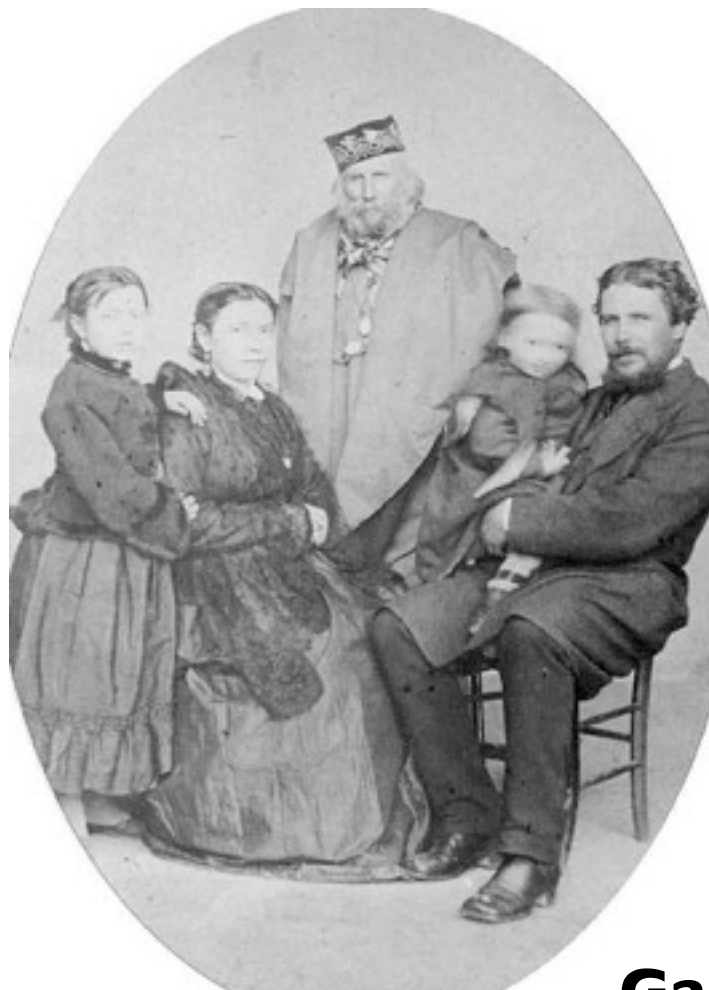
Garibaldi family portrait