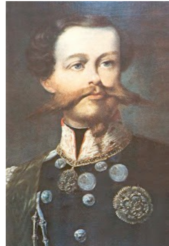
Victor Emmanuel II King of Sardinia